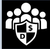
Community Capital Debt Securities