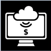
Online Unsecured Lenders