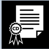
CD as collateral