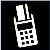
Merchant Cash Advances