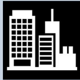
Asset Based Lenders