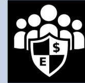
Community Capital Equity Securities